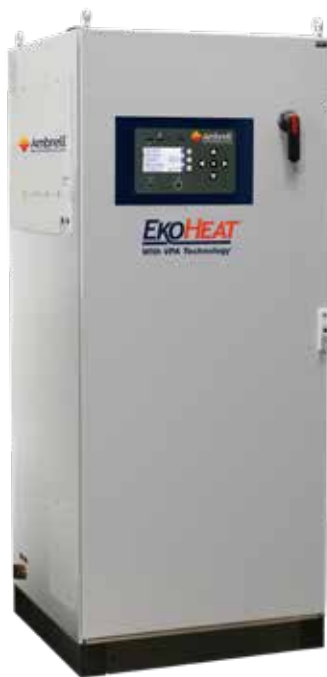
65 to 250 kW with models covering the four frequency bands 50 to 150 kHz 15 to 40 kHz 5 to 15 kHz 2 to 6 kHz