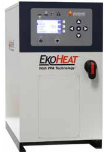
20 to 50 kW with models covering the three frequency bands 50 to 150 kHz 15 to 40 kHz 5 to 15 kHz