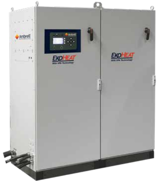
180 to 500 kW with models covering the four frequency bands 50 to 150 kHz 15 to 40 kHz 5 to 15 kHz 2 to 6 kHz