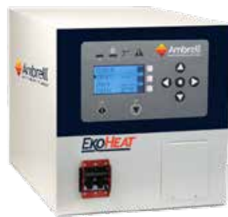
10 and 15 kW 50 to 150 kHz